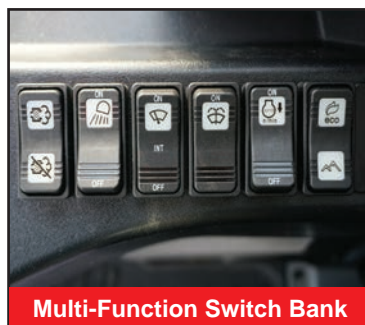
Multi-Function Switch Bank