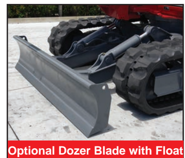
Optional Dozer Blade with Float