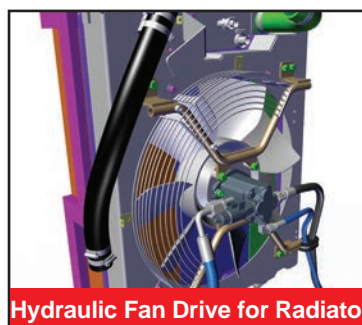
Hydraulic Fan Drive for Radiator